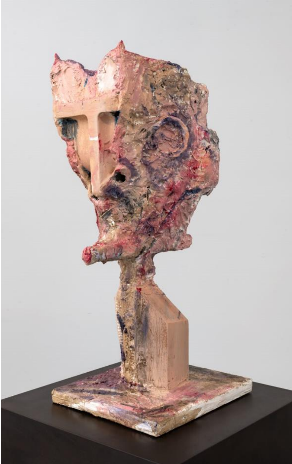
'Impossible' (detail), Huma Bhabha, 2021. Courtesy of the artist & Xavier Hufkens, Brussels