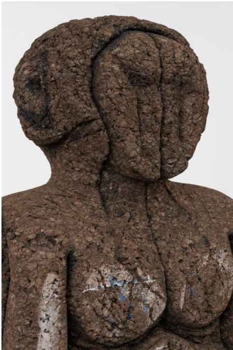
'The Ambitious One' (detail), Huma Bhabha, 2021, private collection. Courtesy of the artist & Xavier Hufkens, Brussels