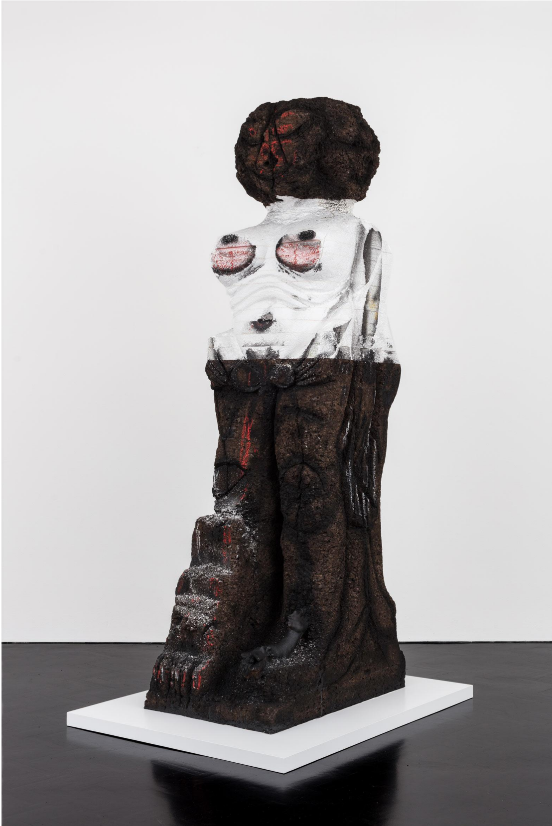
'Castle of the Daughter', Huma Bhabha, 2016. Courtesy of Private Collection, photo: Mark Blower