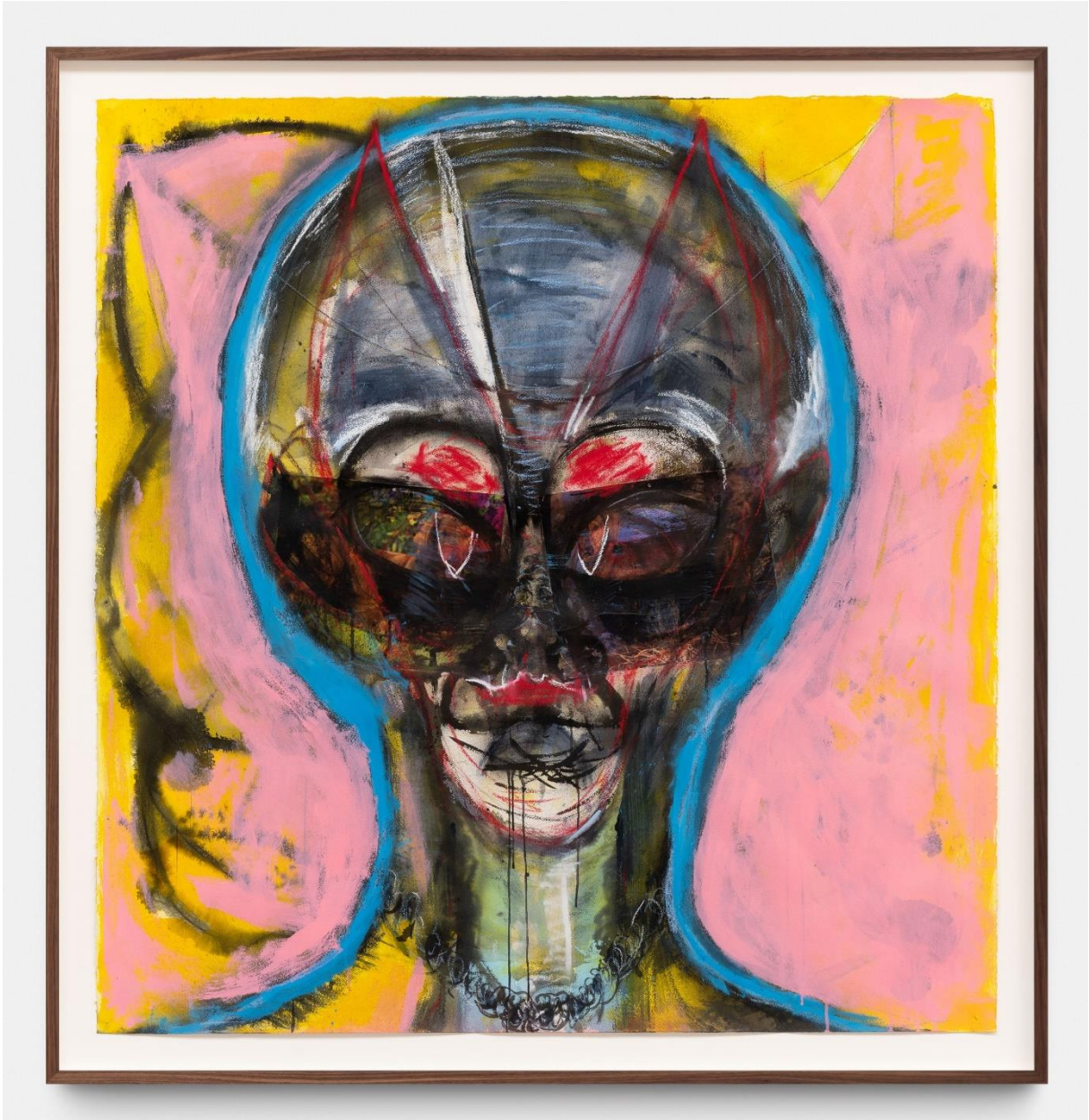
Untitled, Huma Bhabha, 2021, private collection. Courtesy of the artist & Xavier Hufkens, Brussels, photo: HV-studio