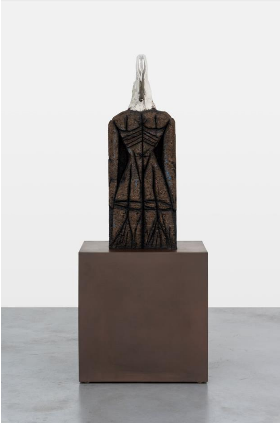
'Present', Huma Bhabha, 2022.