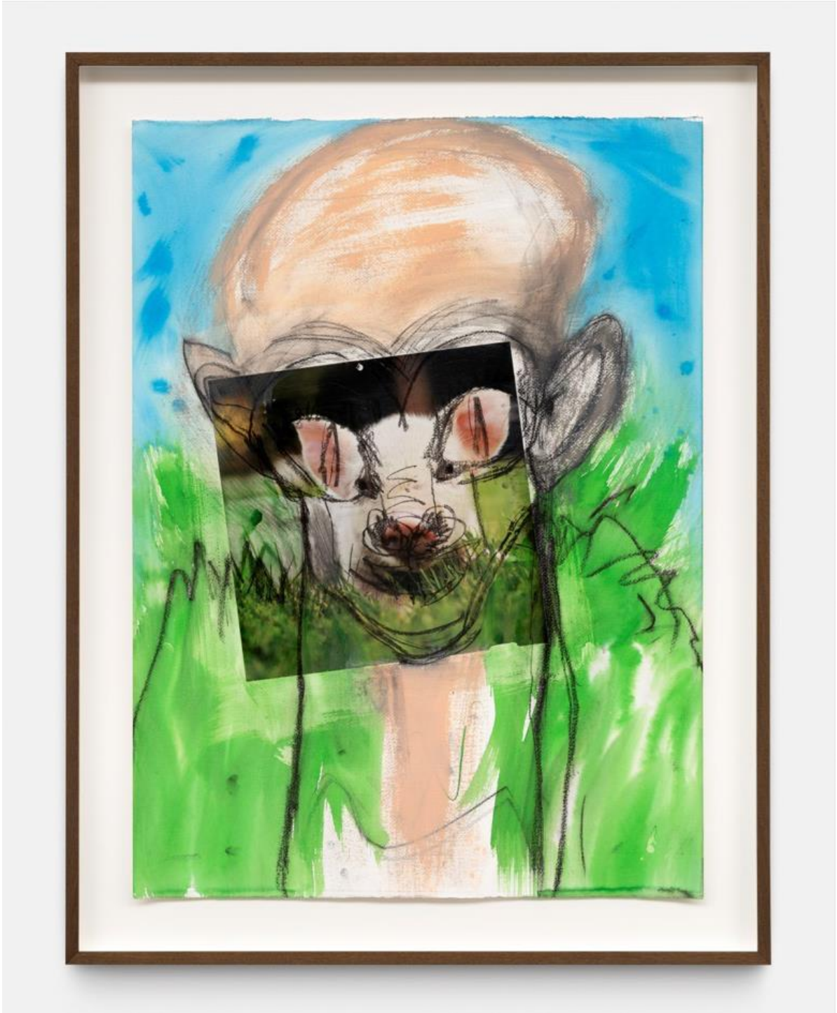
Untitled, Huma Bhabha, 2021. Courtesy of the artist & Xavier Hufkens, Brussels, photo: HV-studio