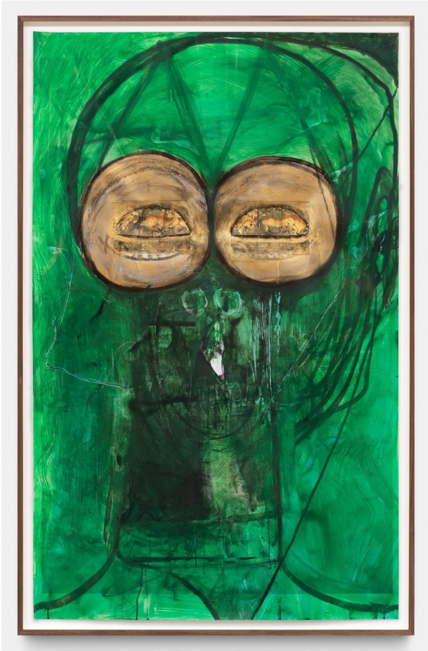
Untitled, Huma Bhabha, 2022.